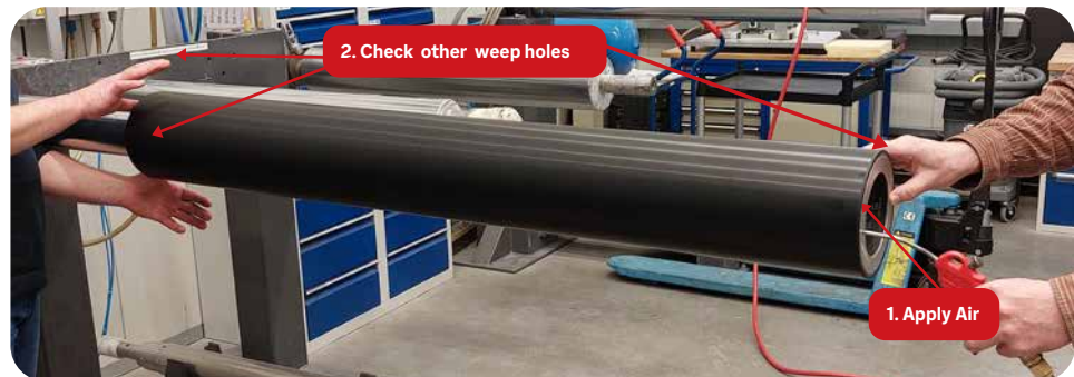
Fig. 2: Weep hole maintenance